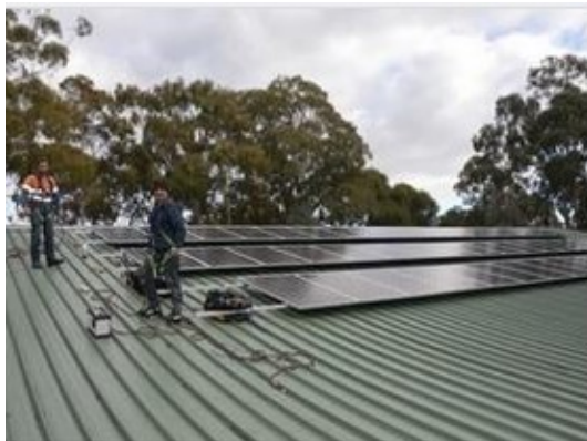
Community Solar Installation Project

Thanks to everyone for the amazing support we have had so far. We are looking for more. If you want to be part of this exciting project so far please email Montysugargliders@gmail.com We need people to join monitoring groups or host a 'nesting box' in specific areas of Banyule. Outcomes will a growing population of sugar gliders and a dynamic corridor development strategy for Banyule.