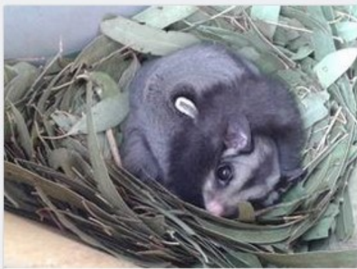
The Banyule Sugar Glider Project

Occupancy of the nesting boxes in these areas will determine where wildlife corridors are which in turn will help us to ensure that corridors are protected and enhanced.